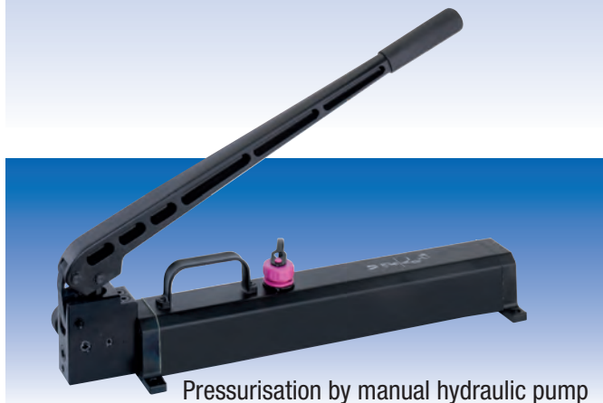
Pressurisation by manual hydraulic pump