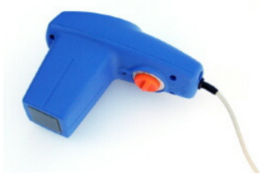
Locus Data-Matrix Reader

The Locus Data-Matrix Reader from DolphiScan is the first reading device in the world to require no contrast when reading a 2 D code. Even a painted-over code can be decoded. This is only possible because the reader works ultrasonically and uses no optical components. It is thereby also possible to read codes which have been covered in grime or paint. The Data-Matrix Reader can be connected to a Windows PC or a PDA via a USB connector. The code is then interpreted via special software, which can also be linked to a variety of databases. The data-matrix code, also called 2D code, is mainly used by the aircraft industry. Not only product information but also the entire maintenance during the life-span of the product can be encoded. As a result, the complete "history" of a workpiece is traceable. Depending upon the size, up to 3,600 characters can be encoded and stored in the code. As a result of these advantages, the code is being employed more and more in the automotive and military fields. We would gladly demonstrate this system to you.